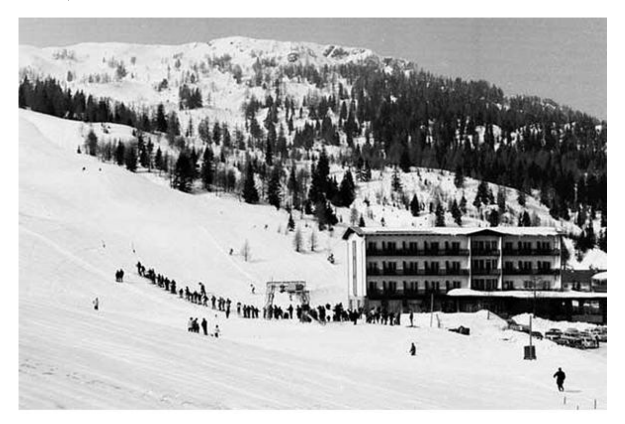
Figure 3. The first ski lift and hotel in Nassfeld

benefit in the same degree because, at a longer distance from the skiing area, the spill over effects decrease).