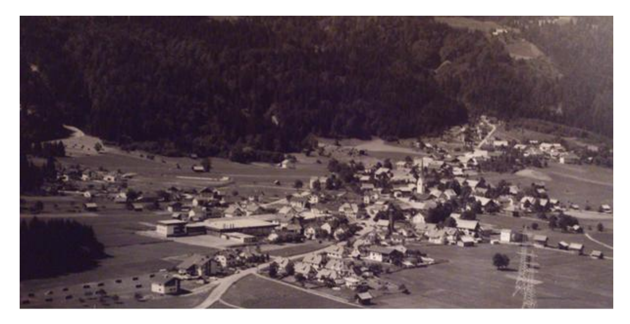
Figure 4. Tröpolach in 1982