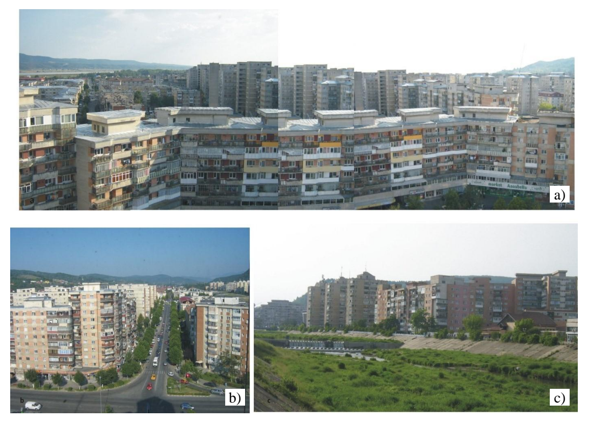
Figure. 3. The Ostroveni – Râmnicu Vâlcea (South) great congregate-type habitat with a population of more than 50,000 inhabitants, built during the communist period for residential purposes and placed in the proximity of the southern industrial platform. a) south-eastern view; b) view towards the western part; c) the left front of Râmnicu (Cina Area)

If they have a certain age and a minimum qualification or if they are unqualified, mostly due to a low level of education, subjects consider themselves or their life partners as " unemployable for life ".