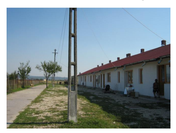
Figure 5. The Nuci Colony (the renewed wing)

A particular case is represented by the Nuci Colony (Figure 5) and the beneficiaries located on the access street from the settlement to the plant. This complex of dwellings, isolated from the rest of