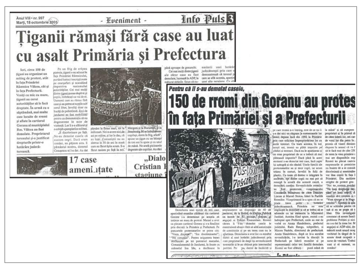
Figure 1 . Press reports of protests against forceful vacancy and relocation or house demolitions in the case of Roma minority from Goranu neighbourhood in front of administrative institutions (October, 2005) Source: Info Plus de Vâlcea (2005), p. 3; Viața Vâlcii (2005)

relation of one individual/family/community/social group, manifested as a spatialgeographical/residential separation (partial or total), as well as «in terms of communication, cooperative interaction, mutual social involvement» (Popescu, 1993, according to Zamfir and Vlăsceanu, 1993, p. 317, defining the "social isolation" – The Dictionary of Sociology does not contain the term "marginalization" (as a process); it contains only the term "marginality").