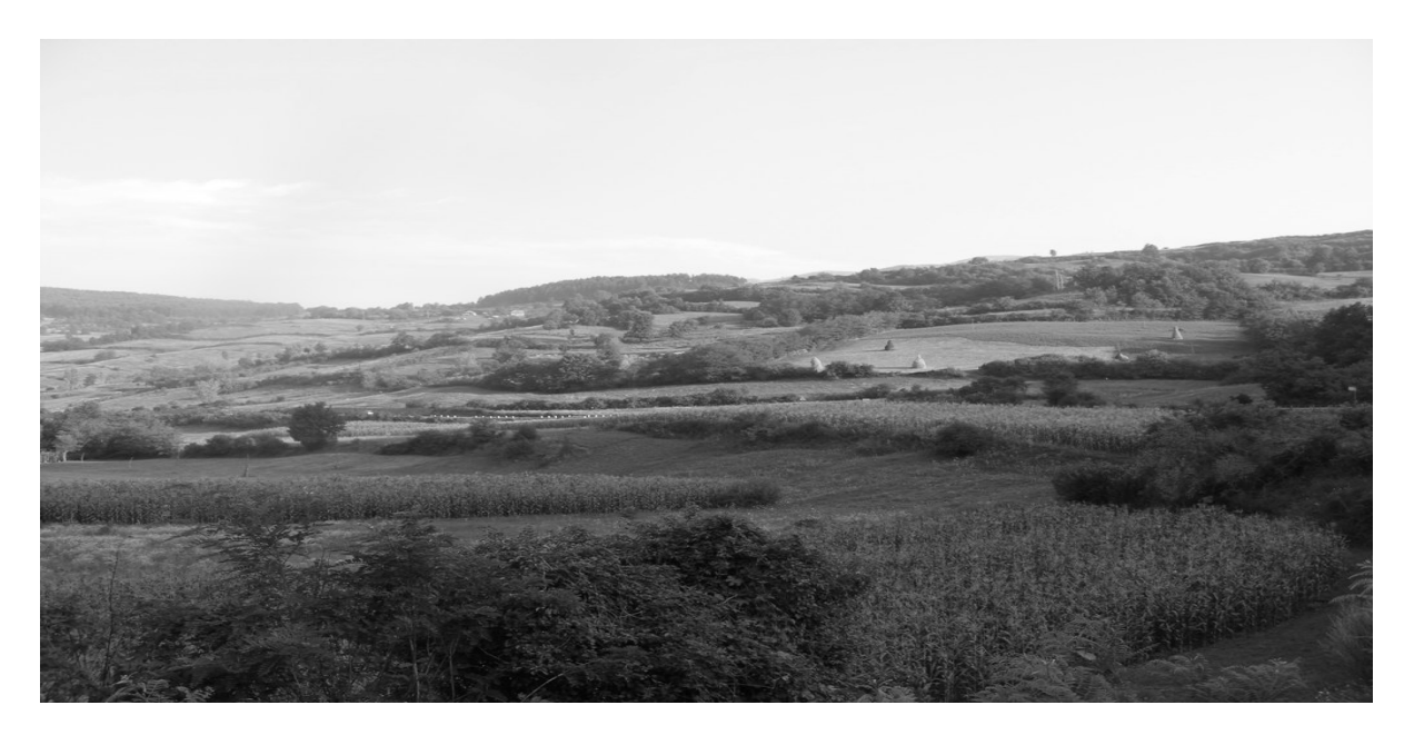
Figure 1. An overview of the Zlatna Depression area

Figure 1 presents the characteristics and the type of land use in the Zlatna Depression area, the lower parts (located in the nearness and along the main roadway) are occupied by arable surfaces, with different crops, slopes are used as hayfields or grasslands, while the upper parts of the region are occupied by the forestry vegetation with broadleaf species.