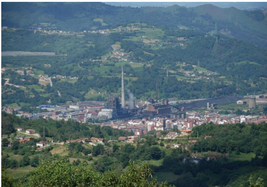
Figure 4. General view of Langreo with the power plant

The lack of political will in the City Hall for leading a change in the model of the city seems to be reflected in other aspects as well, such as its position with regard to the survival of the power plant inside the city (Figure 4), its weak environmental commitment (delays in the development of the environmental policy or the turnover in the environmental council). Thus, with respect to these