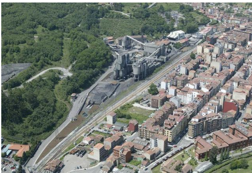
Figure 3. Proximity of industry and city in Langreo

For decades, the continuous growth of industry and population in Langreo, within such a limited space as the bottom of a valley, resulted in an ungainly industrial city where different land uses side by side were common, generating problems of pollution, health, noise, visual impacts and lack of green space (Figure 3). Nevertheless, in 1983, after practically all of the large companies closed, the Langreo City Hall had the opportunity to promote an urban and sectoral change in the city that also protected the main components of its industrial and mining heritage. The latter was not done in cities like Gijón and Avilés, which today do not preserve any trace of their industrial heritage. In Langreo,